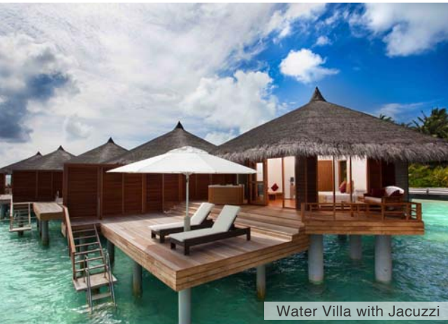
Water Villa with Jacuzzi