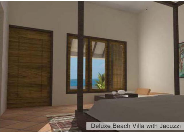
Deluxe Beach Villa with Jacuzzi