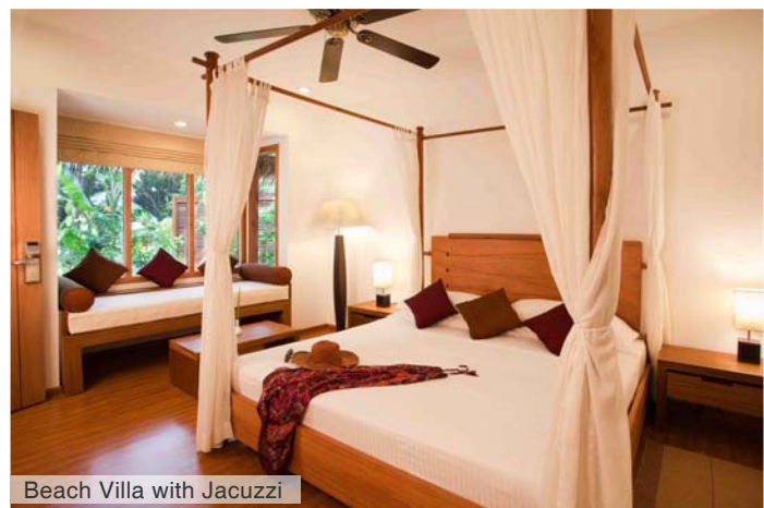
Beach Villa with Jacuzzi