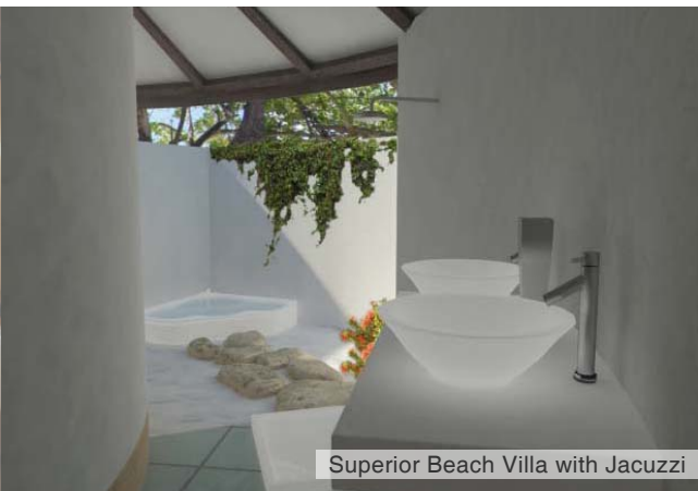
Superior Beach Villa with Jacuzzi