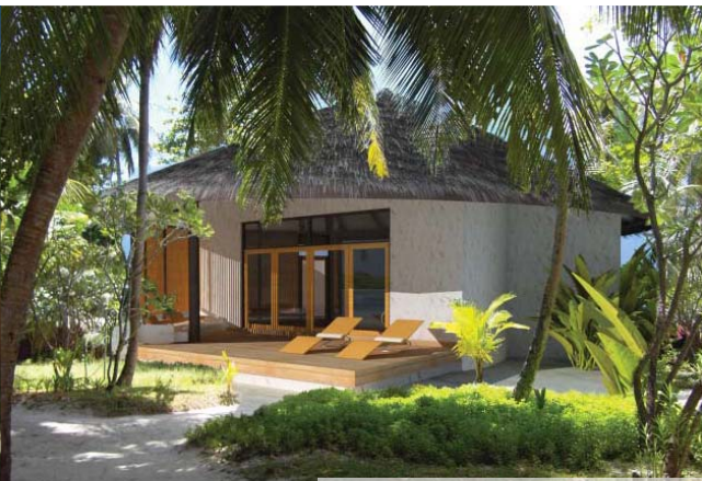
Superior Beach Villa with Jacuzzi